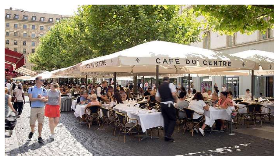
There are fears for the restaurant sector with the new wage

Switzerland's system of direct democracy means the voters have the final say, so the minimum wage is now obligatory.