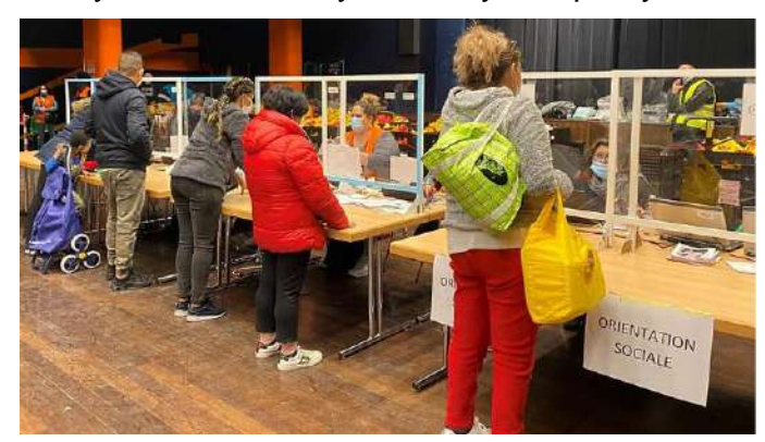
Living in Geneva is expensive and even food bank volunteers struggle to make ends meet

"A single room is 1,000 francs a month, if you can survive on 500 francs a month for food you're a very good manager, health insurance is 550 a month per person. If you are a family with two kids, you barely scrape by."